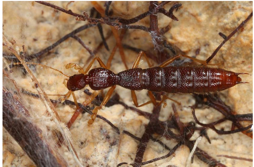
Figure 3. Oedichirus spelaeus n. sp. alive in the field.