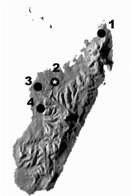
Figure 1. Location of the four main Tsingys areas in Madagascar. 1. Ankarana, 2. Namoroka, 3. Bemarivo, 4. Bemaraha. Asterisk: location of Oedichirus spelaeus n. sp.

cards pinned beneath the specimen. Pictures were taken with a Canon EOS 6D camera combined with a Cognisys Rail macro Stack Shot driven by the software Helicon Remote. Serial pictures were combined using the Helicon Focus 6 software, and finally processed using Adobe Photoshop CS.