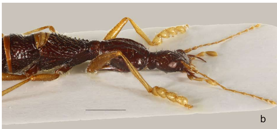
Figure 4.. Oedichirus spelaeus n. sp. habitus, in a. dorsal and b. lateral views. Scale = 1 mm.