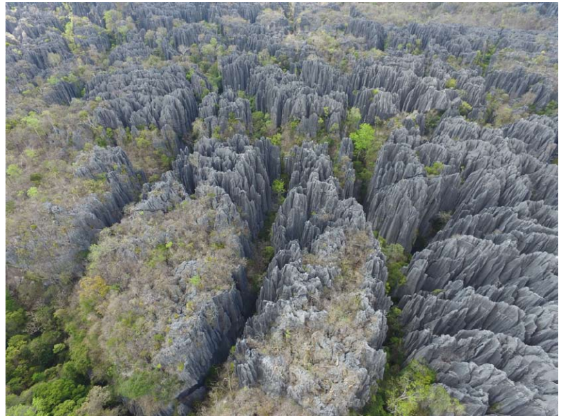
Figure 2. Tsingy de Namoroka, drone view of the canyons.

General appearance of body slender, with troglobiomorphic characteristics: legs slender, antennae long and slender, eyes strongly reduced. Apterous species, lateral border of pronotum complete.