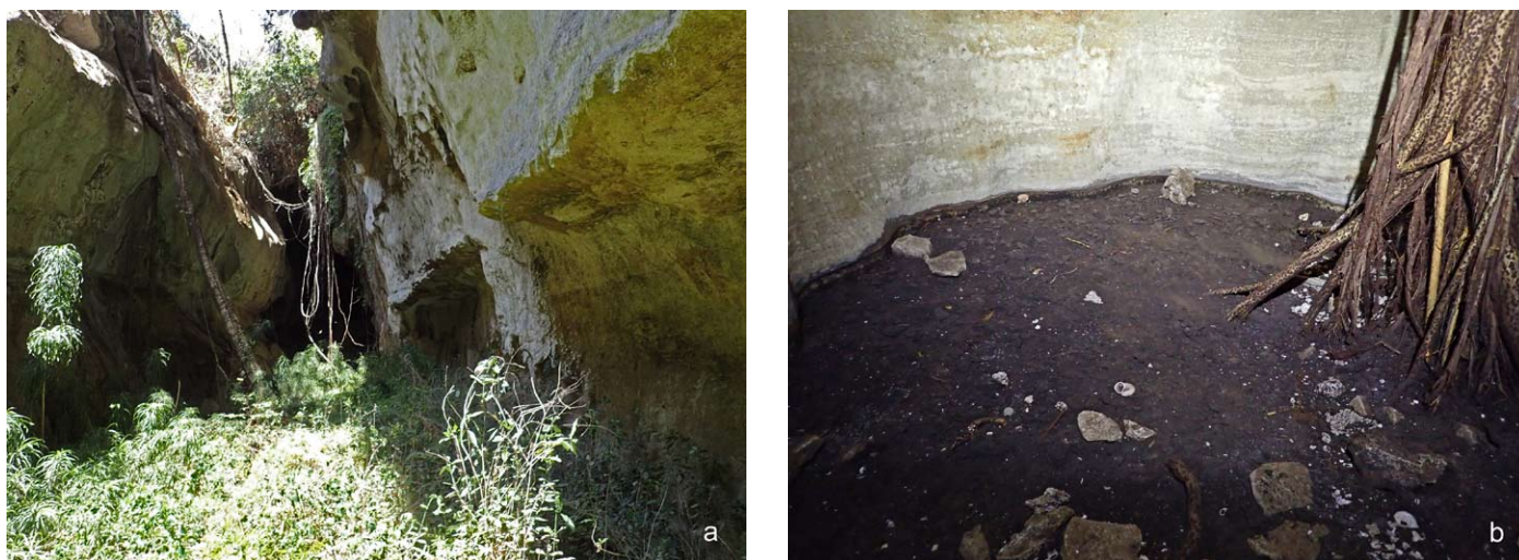
Figure 7. Namoroka, Grotte des Chauve-souris (=Bat Cave), a. entrance, b. chamber in which the new species was collected.

support for the Namoroka 2016 expedition was provided by Chanel Parfums Beauté. The photo shown in Figure 3 was provided by G. Kunz and the photo shown in Figure 2 was provided by S. Gilson.