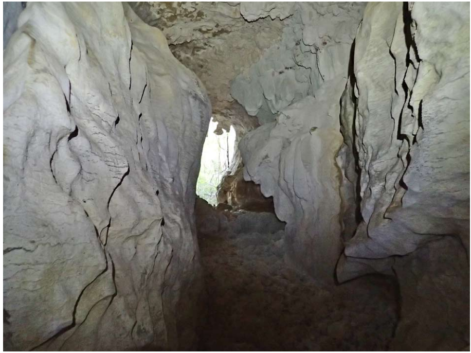
Figure 6. Namoroka, entrance to Grotte du Canyon (Canyon Cave).

type is deposited in GenBank under the accession number: MF795058. These are the first data for Oedichirus available in Genbank.